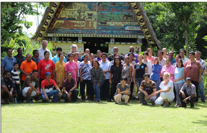
PCC instructors and staff who participated in the two-day workshop that was held at the Ngarachamayong Cultural Center