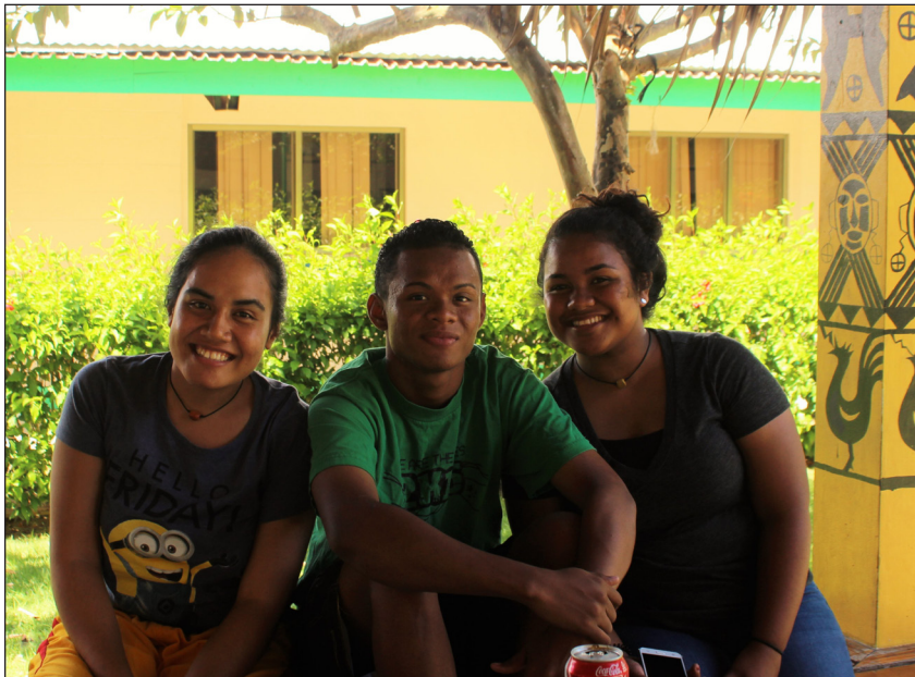
Students enjoying their first week on the college campus

The first day of instruction for the fall semester of Palau Community College (PCC) was on Monday, August 15, 2016. Instructors distributed syllabuses that outlined the lessons that will be taught in the new term. They also shared with the students information about the expected learning outcomes as well as the necessary workload that will guarantee a passing grade for each course.