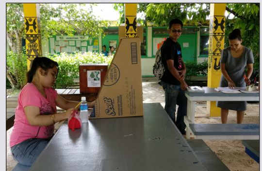
PCC students voting in the 2016-2017 ASPCC Elections held at the Mesekiu Bai

The 2016-2017 Associated Students of Palau Community College (ASPCC) Elections was held on Wednesday, September 07, 2016. All registered students were encouraged to participate in the elections by casting their votes at the Mesekiu Bai. The election will determine the new Student Trustee, ASPCC President-Elect/Vice President, ASPCC Treasurer, ASPCC Secretary, ASPCC Senators/Officers, Freshmen Representatives, and Sophomore Representatives. The island nations represented by the student body also held elections that identified their island state student representatives. ASPCC is responsible for the general welfare of the student body. Its members represent the students and are responsible for organizing activities that promote a sense of school spirit and unity among the students. The 2016-2017 ASPCC Elections was organized by the PCC Student Services Office.