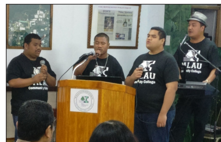
PCC Music Club performance