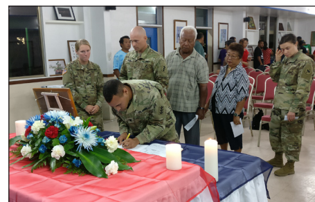
Community members signing guestbook