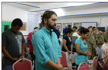
Opening prayer for the memorial service