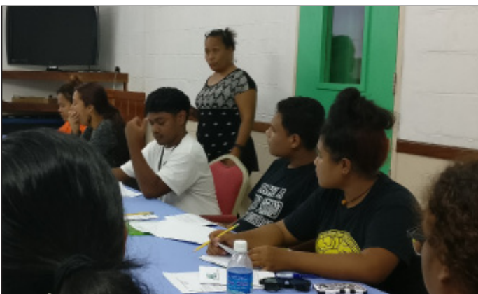
ASPCC Orientation Meeting held at the PCC Conference Room