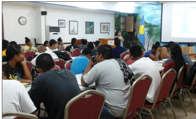
PCC students attending the Financial Aid Orientation 2

The Office of Admissions & Financial Aid has conducted the Financial Aid Orientation 2 sessions from September 12, 2016 to 23, 2016 at the Assembly Hall. A total of thirteen (13) sessions were conducted and 79% of the students attended the sessions, that is four hundred forty nine (449) students out of five hundred sixty nine (569). We will reschedule other sessions to accommodate those students who did attend the sessions.