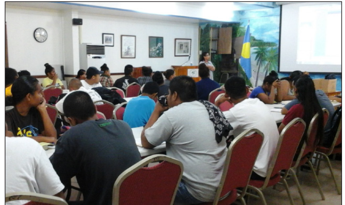
PCC students attending the Financial Aid Orientation 2

The Office of Admissions & Financial Aid has conducted the Financial Aid Orientation 2 sessions from September 12, 2016 to 23, 2016 at the Assembly Hall. A total of thirteen (13) sessions were conducted and 79% of the students attended the sessions, that is four hundred forty nine (449) students out of five hundred sixty nine (569). We will reschedule other sessions to accommodate those students who did not attend the sessions.