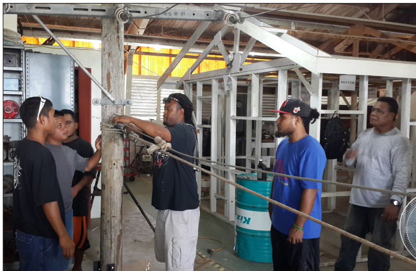
PPUC Lineman demonstrates practical wiring applications for PCC students