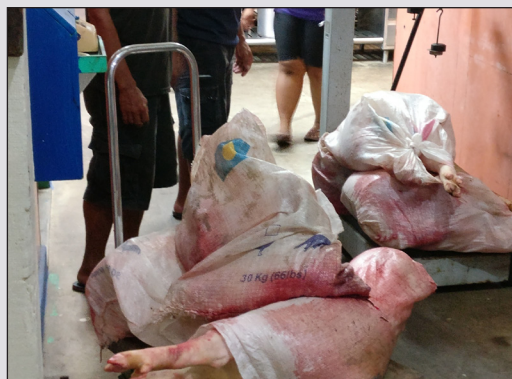
Pigs donated to PCC Cafeteria