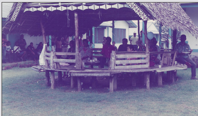
The PCC Hut featured in the photo was once located on the lawn in front of the PCC Assembly Hall