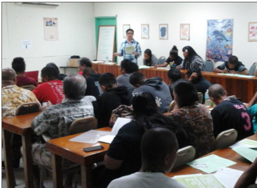
Financial Aid Night Session with Emmaus-Bethania High School and Belau Modekngei High School