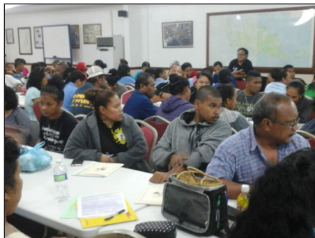
Financial Aid Night Session with Palau High School

As soon as the students complete their financial aid forms and receive their acceptance letters, the PCC Admission & Financial Aid Office will be able to process their financial aid awards showing the types and amount of money they will receive for the 2017-2018 Award Year.