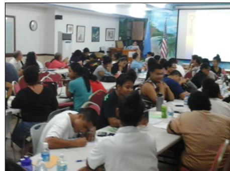
Financial Aid Night Session with Palau Mission Academy & Mindszenty High School