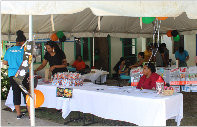
PCC students participating in the CDU Halloween Bash Event

On Wednesday, October 26, 2016 the Communicable Diseases Unit (CDU) of the Palau Ministry of Health (MOH) organized a Halloween Bash Event. Hosted on the campus of Palau Community College (PCC), the event encouraged students as well as individuals from the community to participate in activities that promoted awareness for communicable diseases such as the Human Immunodeficiency Virus (HIV), Sexually Transmitted Infections (STIs), Tuberculosis (TB), and Leprosy. HALLOWEEN BASH, CONTINUED ON PAGE 3