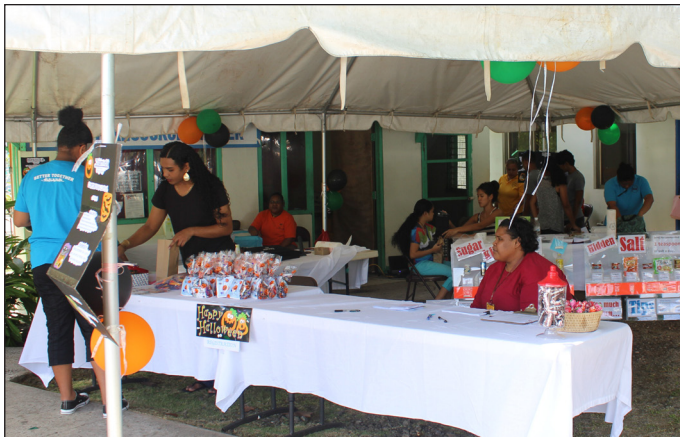
PCC students participating in the CDU Halloween Bash Event

On Wednesday, October 26, 2016 the Communicable Diseases Unit (CDU) of the Palau Ministry of Health (MOH) organized a Halloween Bash Event. Hosted on the campus of Palau Community College (PCC), the event encouraged students as well as individuals from the community to participate in activities that promoted awareness for communicable diseases such as the Human Immunodeficiency Virus (HIV), Sexually Transmitted Infections (STIs), Tuberculosis (TB), and Leprosy. HALLOWEEN BASH, CONTINUED ON PAGE 3