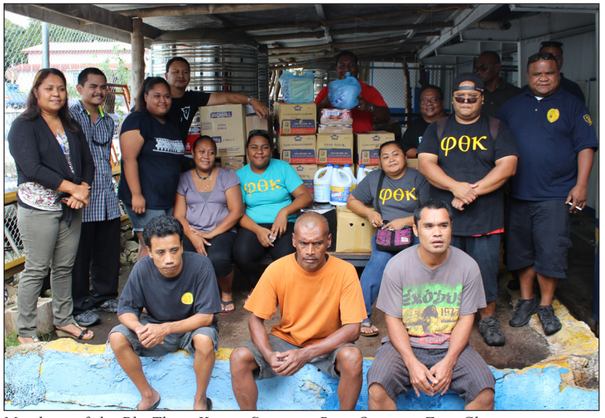
Members of the Phi Theta Kappa Society - Beta Omicron Zeta Chapter presenting donations to the Division of Corrections under the Palau Bureau of Public Safety

On Thursday, November 10, 2016 the members of the Phi Theta Kappa International Honors Society - Beta Omicron Zeta Chapter (PTK-BOZ) donated nonperishable supplies to the Division of Corrections under the Bureau of Public Safety at the Ministry of Justice. The nonperishable supplies donated included items such as cleaning supplies. These items were donated by community members during the PTK-BOZ Project Graduation Event on Friday, May 06, 2016.