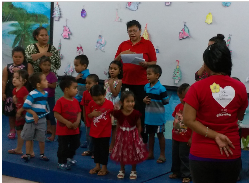
Children from the PCC Day Care Center performing during their Christmas Program at the PCC Assembly Hall

On Wednesday, December 21, 2016 a Christmas Program was organized for the children in the Palau Community College (PCC) Day Care Center. The children from the PCC Day Care Center performed songs that included the Palau National Anthem, a special traditional chant ( chesols ), Christian hymns, the alphabet song, and a song about numbers.