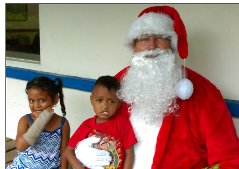
PCC Santa Claus meeting with the children after the Christmas Program