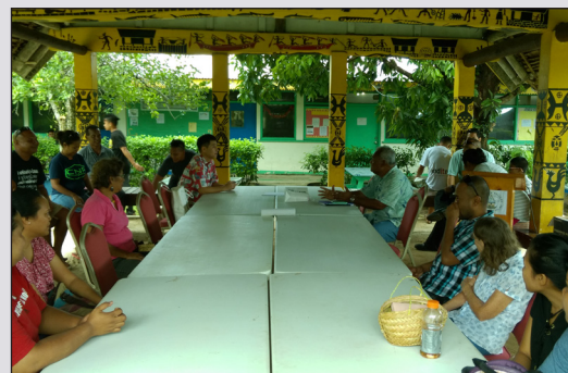
2016 Christmas Luncheon hosted by the college

Palau Community College (PCC) hosted a Christmas Luncheon for its faculty & staff members on Friday, December 23, 2016. All employees as well as students were invited to join the celebration. The Christmas Luncheon was an opportunity for all college employees to enjoy the festive season together. It was also a token of appreciation from the college to all its employees. To all the faculty & staff members who have been working diligently throughout the year in order to provide quality services and excellent learning experiences, PCC expresses its deepest gratitude. Without the dedication of its faculty & staff, the college could not have continued to provide the necessary academic programs or work-related training that is needed to improve communities through Micronesia and the Pacific region. Palau Community College also takes this opportunity to wish each of its employee a happy holiday season and a prosperous new year.