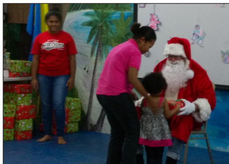
PCC Day Care Center Children receiving gifts from Santa Claus

The PCC Day Care Center would also like to recognize the Republic of Palau President Tommy E. Remengesau, Jr. and First Lady Debbie Remengesau for donating the following: twenty (20) packs of chips, twenty-eight (28) gummy bear snacks, twenty-five (25) boxes of crayons, and coloring books. Because the donated items were not enough to distribute evenly amongst the children, the PCC Day Care Center will be store the donations for the children's when classes resume on January 09, 2017.