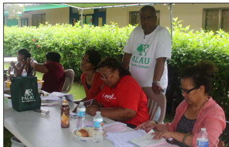
PCC Staff assisting with tax refund forms

If you are interested in becoming a bi-weekly contributor of the PCC Endowment or would like more information regarding the PCC Endowment Fund, please contact the PCC Development Office at (tel): 488-2470/2471 ext. 251, 252, or 253.