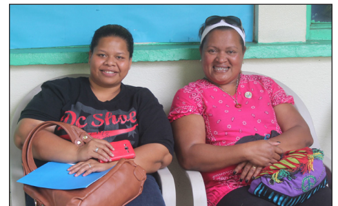
Bi-weekly contributors attending the luncheon