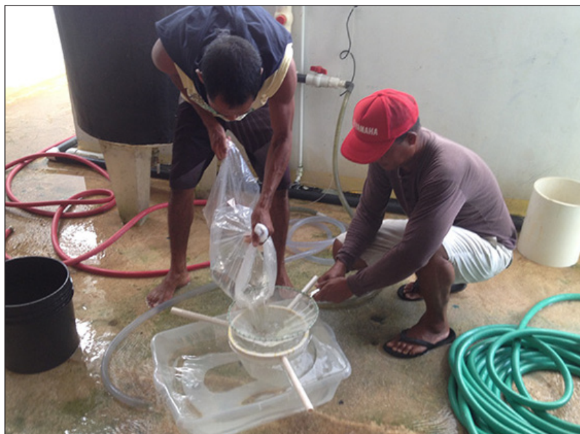
Milkfish eggs that were delivered to the PCC Multi-Species Hatchery in Ngermetengel, Ngeremlengui State

contributed by the Palau Community College Cooperative Research & Extension (PCC-CRE)