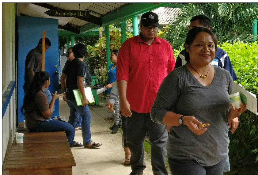
PCC students enjoying the campus on the First Week of Instruction of Spring 2017

The First Day of Instruction for the 2017 Spring Semester of Palau Community College was on Monday, January 16, 2017. Students flooded the college campus to attend their classes and meet with their instructors in preparation for the new semester. They also met with their Academic Advisors/Counselors at the PCC Student Life Office to finalize their academic plans.