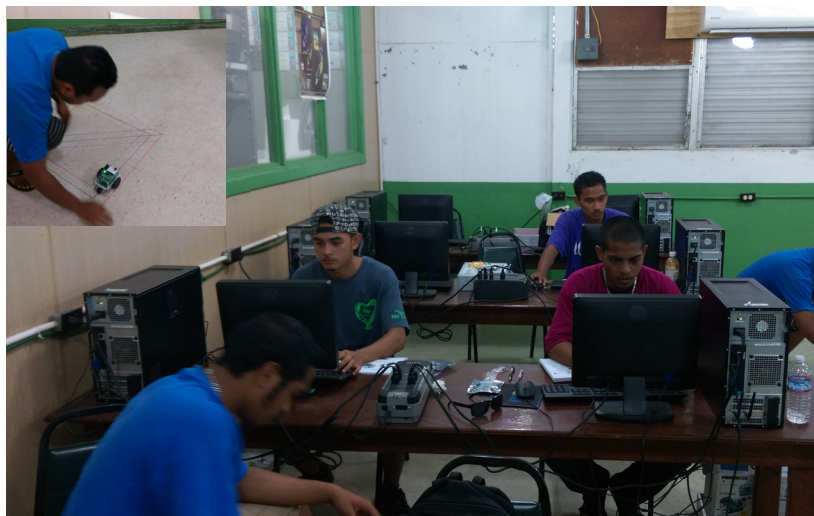
Students currently enrolled in robotics course working on current projects

PCC, in its continued pursuit to expand and advance our range of educational offerings to our students, has recently introduced the study of Robotics, into the General Electrics Technology program, in the form of two new courses, GE128 Robotics I and GE212 Robotics II. GE128 covers basic robotic programming, assembly, testing, motor control, interfacing, light and sound sensory, and remote control. Students who take these courses will be building robots to learn skills in wiring, source coding, tuning, and problem solving in areas such as robotics development and robot navigation. Upon completing the GE128 course these students will advance to course GE212 which will give them experience in the mechanical assembly and programming of quad-copter robotics, commonly known as flying drones. These students will learn the mechanical build of these drones as well as drone technology application such as land mapping and surveying, real-estate observation and aerial video. Through these courses they will also experience, in depth, airborne video system installation. In this day and age, robotics technology is continuously approaching new levels of advancement and is every day becoming more intergrated with peoples' daily lives, making significant strides in multiple areas that benefit humankind, and Palau Community College is committed to advancing it's curriculum to prepare our students today, for our world tomorrow.