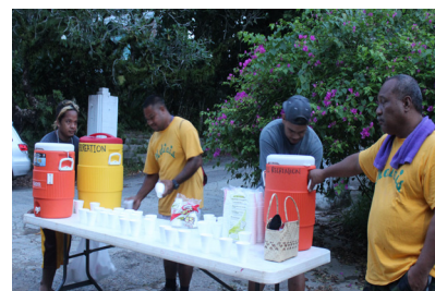
Staff and students manning the water station in Meyuns