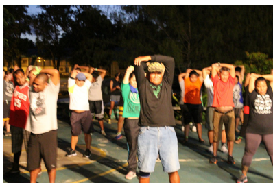
Participants warming up

The 24 th Charter Day marks the transition date of the Micronesian Occupational College into Palau Community College. Since 1993, PCC has continued to help students in Palau and the region of Micronesia reach their potential by providing quality education programs and services. PCC remains Palau's only institution of higher learning that produces students who contribute to their communities.