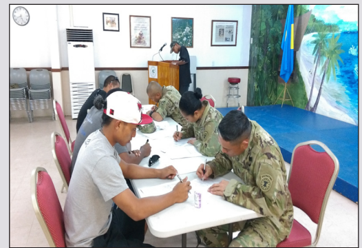
US Army Recruiters assisting student register for ASVAB test

On April 3 - 6, 2017, The U.S. Army Recruiter Station in Guam visited PCC and provided Armed Services Vocational Aptitude Battery (ASVAB) registration, information, and testing. ASVAB is the most widely used multiple-aptitude test battery that measures your strengths, weaknesses, and potential for future success. The ASVAB also provides you with career information for various civilian and military occupations and is an indicator for success in future endeavors whether you choose to go to college, vocational school, or a military career. ASVAB test scores are broken down by the individual sub-tests and composites of the sub-tests. One of the most critical of these scores is the Armed Forces Qualification Test, which is used to determine if you are qualified to join the military service. Each armed service branch utilizes the qualification AFQT score for enlisting individuals in their service.