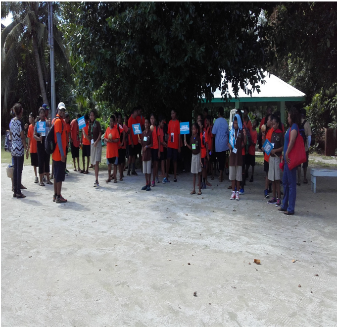
ETS participants field trip in Kayangel State