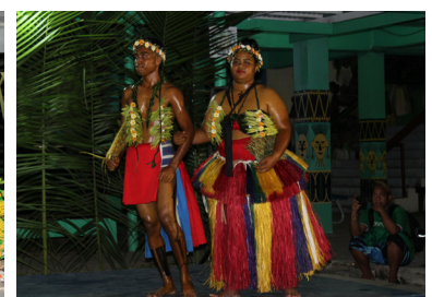
Traditional wear from the island of Yap