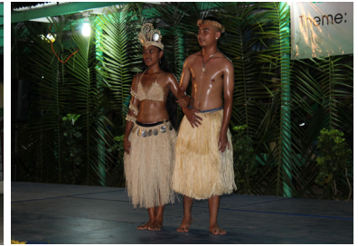
Marshallese traditional wear