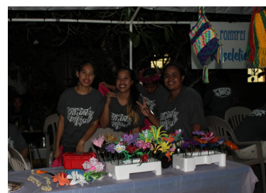
Pohnpei booth displayed island handcraft