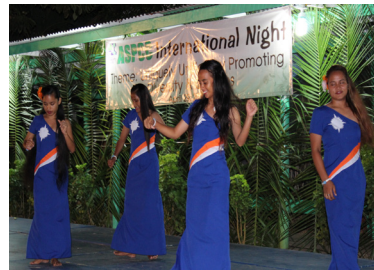
Contemporary dancers from Marshall Islands