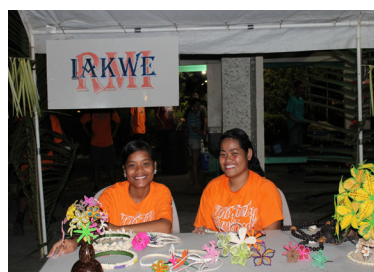
Marshallese famous seashell handcraft