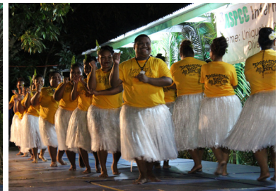
Palauan contemporary dancers