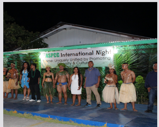
PCC students model their island traditional wear and modern attire