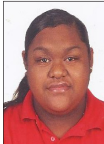
Ki-Shea Ngesmos Liep Terry Ngirmang Nursing Scholarship