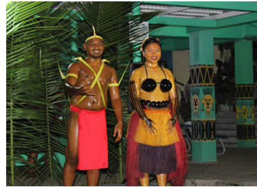
Traditional wear of Palau