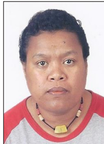
Viola Francis Terry Ngirmang Nursing Scholarship