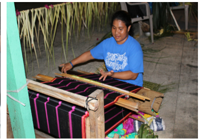
Yap famous clothing material