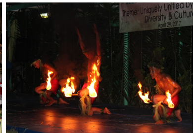
Yapese fire dancers