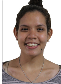
Mary Catherine Wiley Moylan's Insurance Scholarship