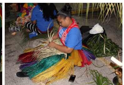
Yap student weaving traditional betel nut basket