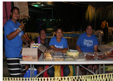
Yapese students selling various treats