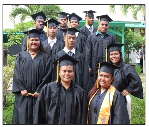
Agricultural Science Program