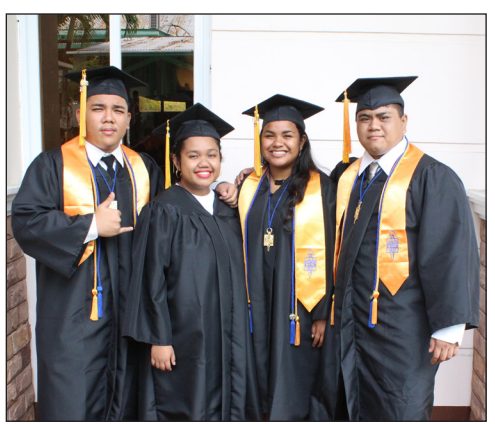
Liberal Arts Program