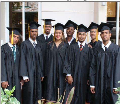
Automotive Mechanics Technology Program