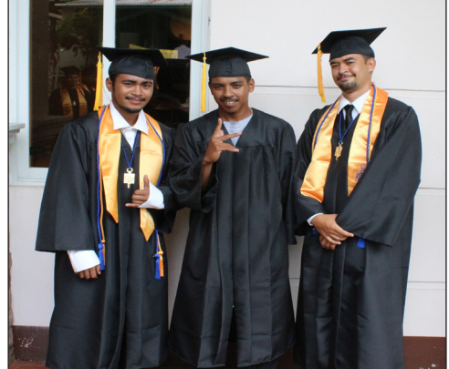
Construction Technology Program