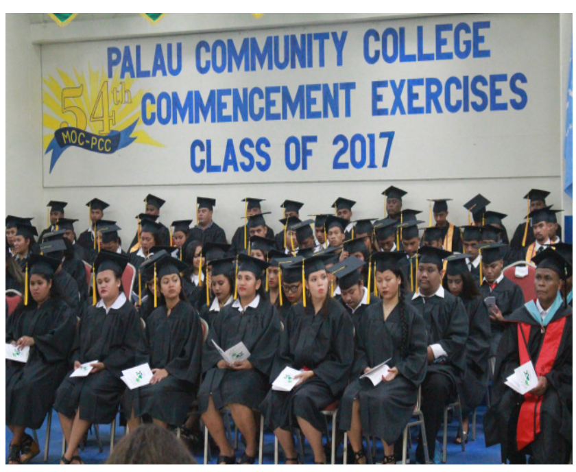
PCC Graduating Class of 2017

Palau Community College (PCC) celebrated its 54<sup>th</sup> Commencement Exercises last Friday, May 19, 2017. The ceremony was held at the PCC Cafeteria and recognized the academic achievements of one hundred thirty-nine (139) graduates.