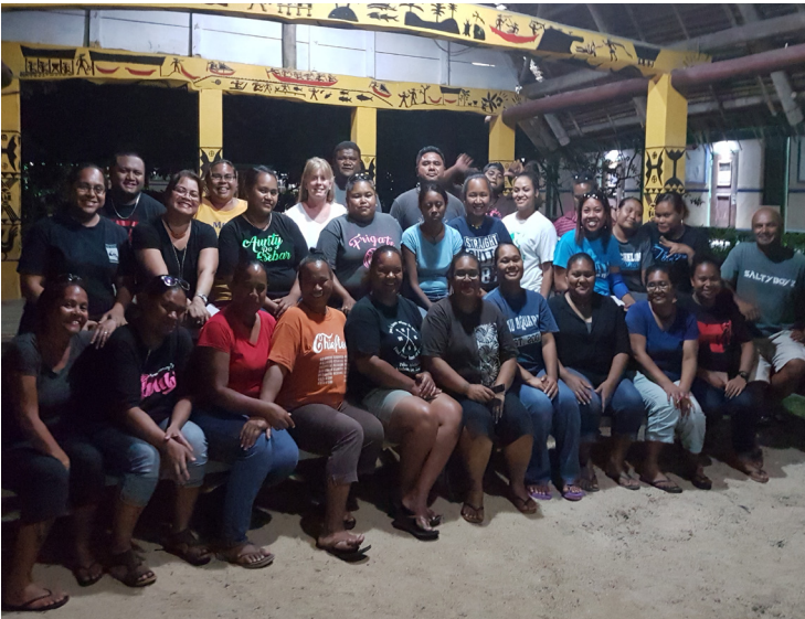
2017 SDSU Bachelor Cohort Students

With much needed bachelor's degree credentials in the Republic of Palau. PCC and SDSU Administration, Rehabilitation, & Postsecondary Education Department has once again partnered to commence another bachelor's cohort. The bachelor's program is designed to allow working professionals to complete an advance degree without having to leave the island or their current position. The program is also designed to prepare Palau teachers and other interested individual from government offices, PCC, and other agencies with skills and expertise to provide high quality public services in their area.