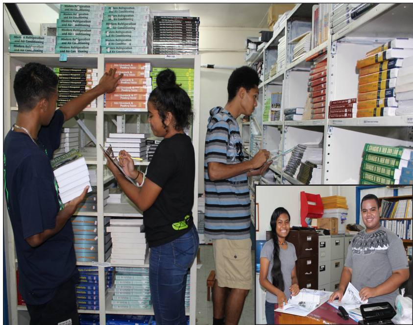
Upward Bound Program summer work study students

On June 5, 2017, the Upward Bound Summer Work Study program began with a total of eighty-eight (88) students. Each student were placed in various offices of the national government, non-profit organizations and Palau Community College (PCC). UB work study students are also enrolled in summer preparatory classes such as English, Math, and foreign language. The purpose of the program is to expose students to various work place and to learn basic work etiquette, office management, and communication.