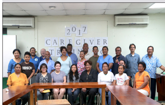
A group of certified caregivers with instructors and guests during the award ceremony at PCC