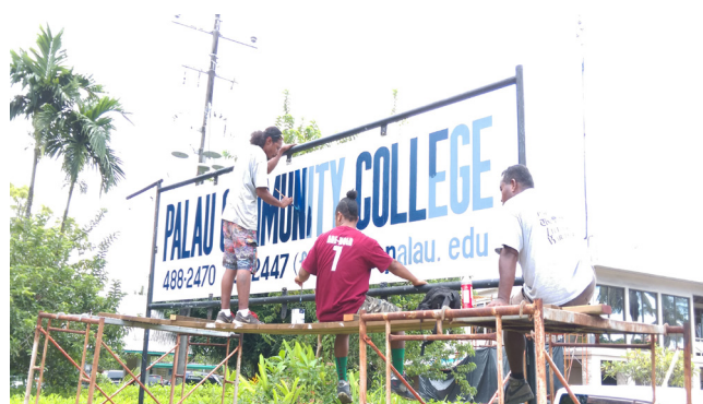
As part of ongoing "Join the Team and Keep PCC Clean" initiative, PCC Maintenance and students did a great work on our college sign board.

The Caregiving Program began in June 12, 2017. Another group will begin training on June 26, 2017. The Caregiving Program is free of charge and open to any person interested in learning how to properly care for the bed-ridden individuals.