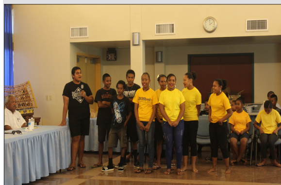
Summer Cultural Program Commencement