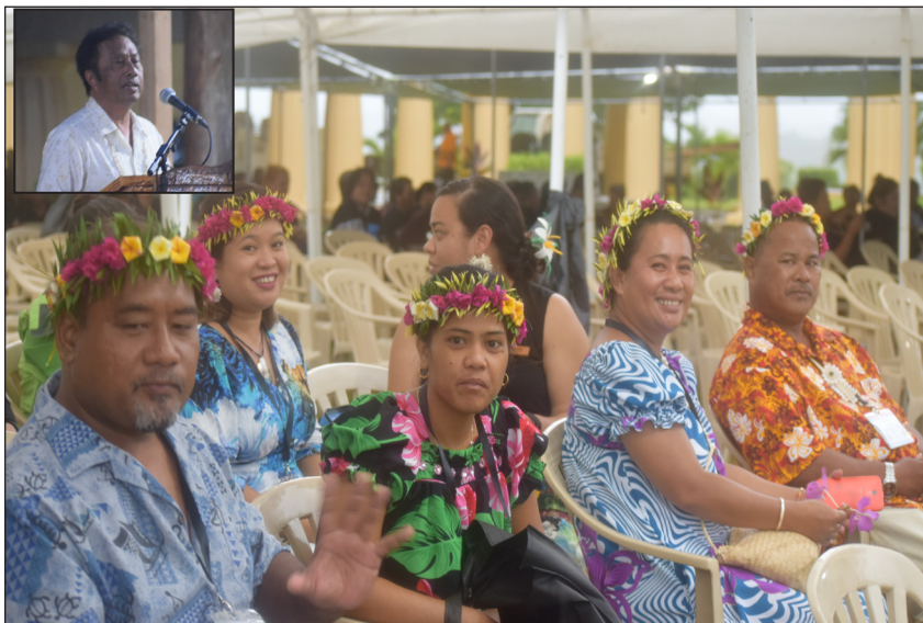
Inset: President Tommy E. Remengesau Jr. giving special remark; Teachers of the Year from the Pacific schools during PEC Opening Ceremony

The 30th Pacific Educational Conference (PEC) which seeks to find solutions and advances in raising student achievement and educators effectiveness took place on July 17 – 20 2017 in Koror and was last hosted by the Republic of Palau in 2006.