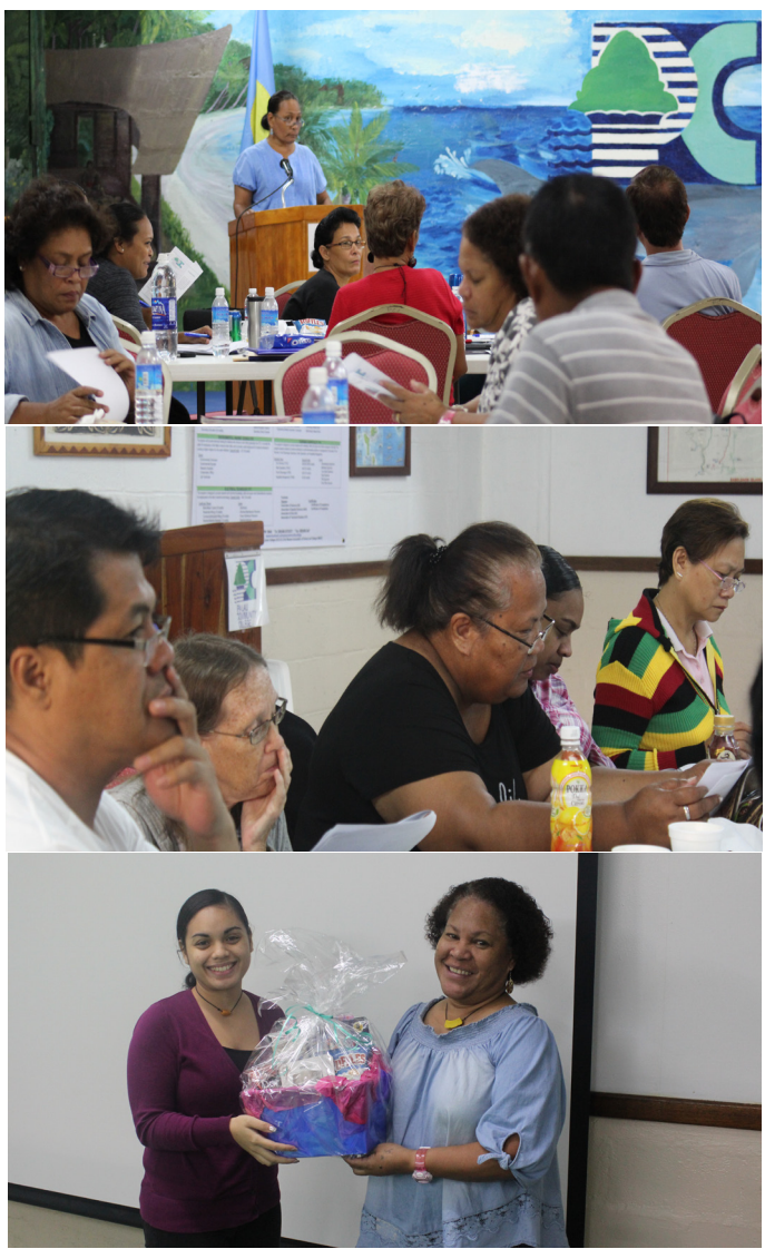
Institutional Effectiveness participants during training at PCC Assembly Hall and IR office prizes for lucky winner

The next Institutional Effectiveness training is scheduled for Spring 2018. There were 62 participants at the training on day 1 and 55 participants on day 2. IREO takes this opportunity to thank all participants for their participation most especially in group discussions and presentations.