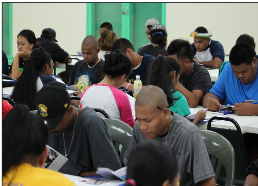
New students attending the orientation at PCC Cafeteria.