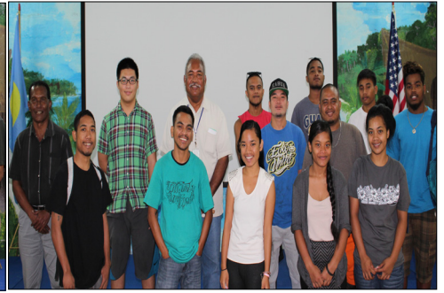
ROC Taiwan student with Marshallese Student