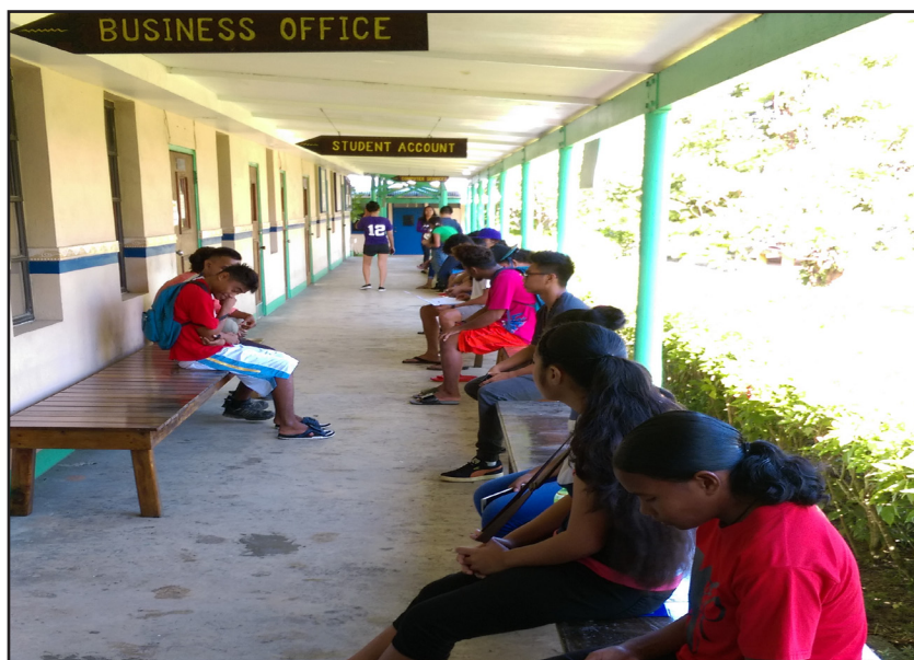
Students waiting in line to register for 2017 Fall Semester

Registration for 2017 fall semester of Palau Community College (PCC) took place on Thursday, August 10, 2017. New, Continuing and returning students gathered at the campus of the school to meet with their academic advisors at the Office of Student Life. Students who pre-registered for classes pick up their schedules while those who hadn't pre-registered during the Fall Semester including new students met their counselor/advisor to complete the registration process. Last week, students roamed about campus completing forms, paying fees, and completing class schedules with counselors. According to Admissions and Records, the unofficial total of enrolled students at the end of registration on Friday, August 18, 2017 was over 500. PCC would like to welcome back all new, returning, and continuing students to the Fall 2017 semester. May the new school year be prosperous for you all!