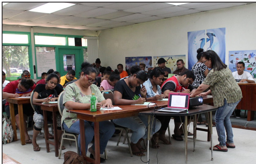
Students attending a financial aid session at the CE Training Room

Beginning Wednesday, August 30, 2017 the Office of Admissions & Financial Aid of Palau Community College (PCC) conducted a series of Financial Aid Orientation 2 sessions with the students currently enrolled at the college. The sessions were held at the Continuing Education (CE) Training Room. A requirement for all financial aid applicants, the Financial Aid Orientation 2 sessions provided information about financial aid policies and regulations. The Office of Admissions & Financial Aid staff were present at the meetings to explain the financial aid information thoroughly as well as assist students who have not completed their forms or applications. The meetings concluded on Friday, September 08, 2017.