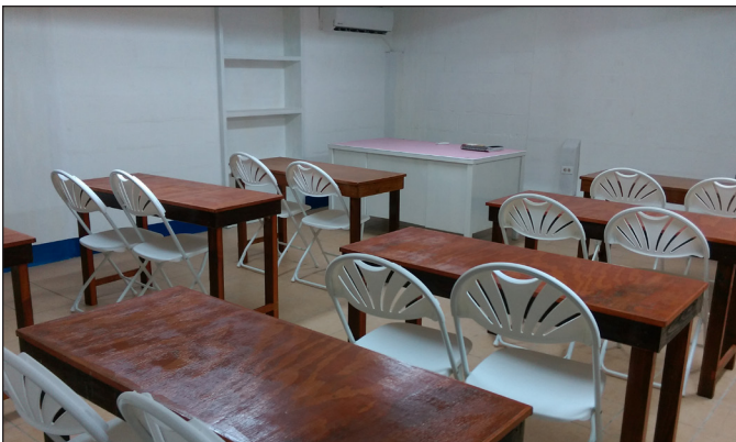
CTE Academy Lab School Classroom