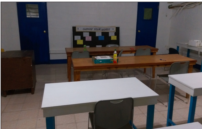
Academic Tutoring Classroom