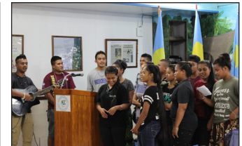
PCC Pohnpeian Students singing hymns at the 9/11 Memorial Service