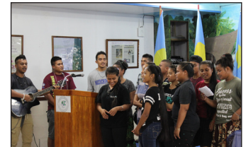
PCC Pohnpeian Students singing hymns at the 9/11 Memorial Service