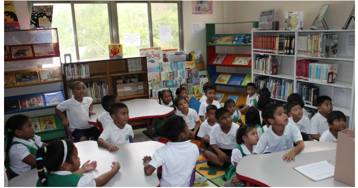
Maris Stella 1 st graders at Kid's Zone at PCC Library