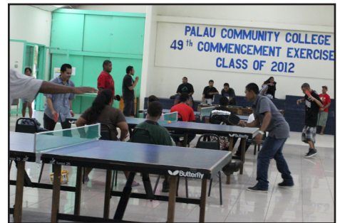
Recreation time playing ping pong.