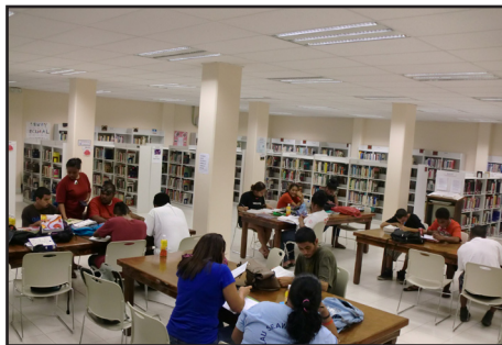
Students studying at TSL PCC library.