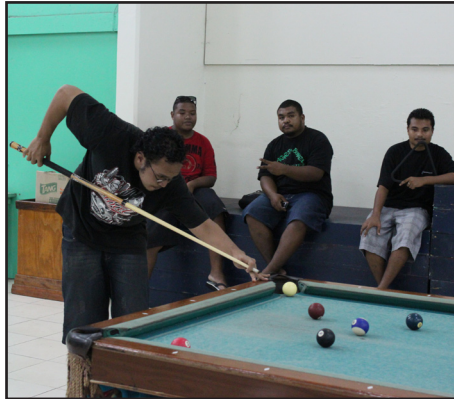
Recreation time playing billiards.