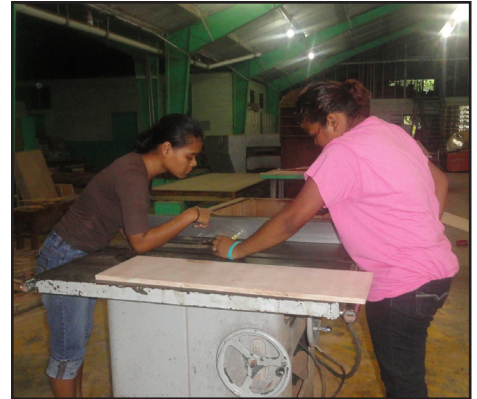
Construction Technology students in class.