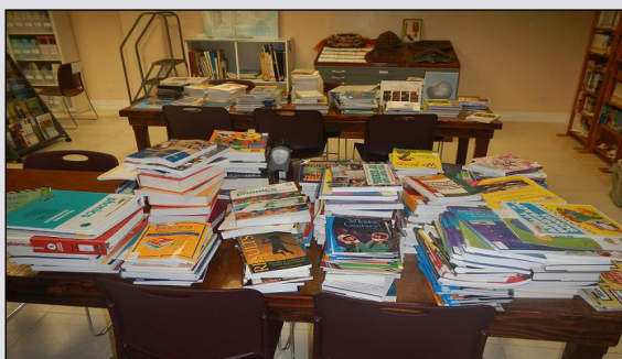
Books donated to the PCC Library from PREL.