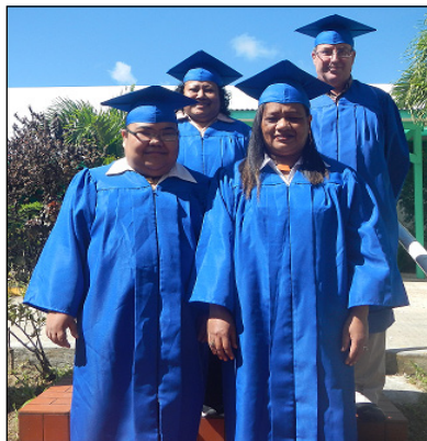
MOH Substance Abuse & Addiction Treatment Counseling Program