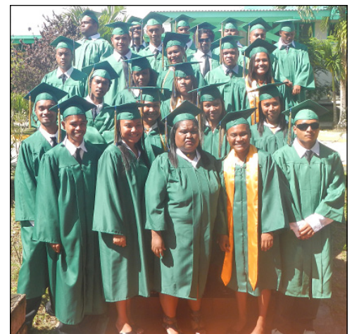
Adult High School