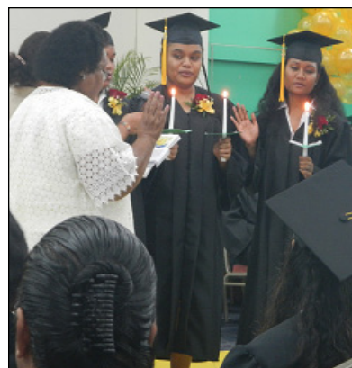
Nurses taking the Nightingale Pledge