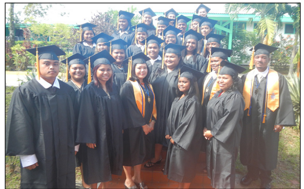
School of Business