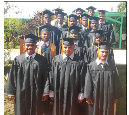
School of Technical Education