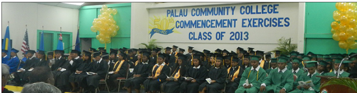
Palau Community College graduating Class of 2013 at the 50 th Commencement Exercises.