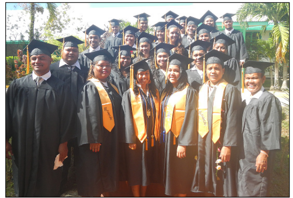
School of Arts & Sciences