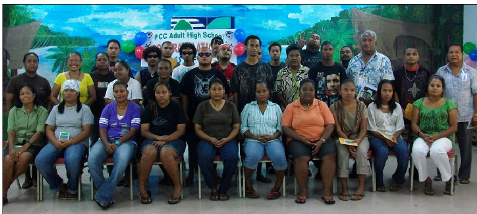
Students of Adult High School attending the awarding ceremony at the PCC Assembly Hall.