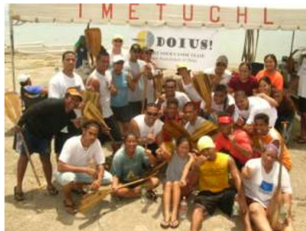
PCC Students Paddling Team