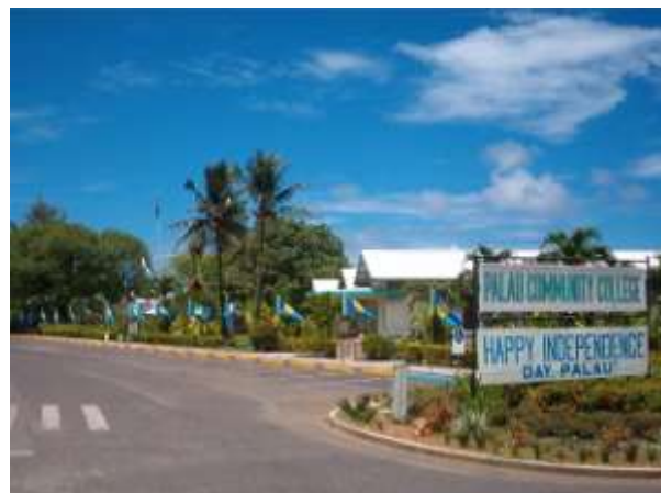
Front of Palau Community College, 2007