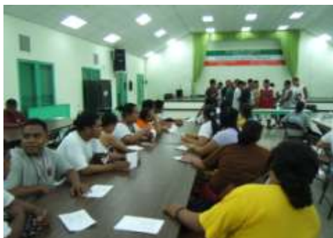
PCC Students Tuesday Night Program 2008