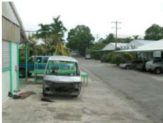
Technical Education Buildings 2008