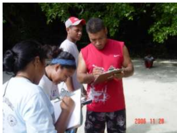
PCC Marine Science Students