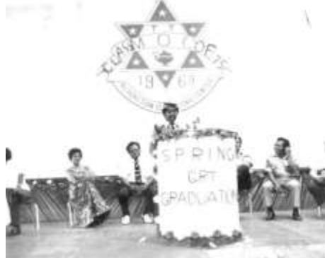
MOC Spring Graduation 1975