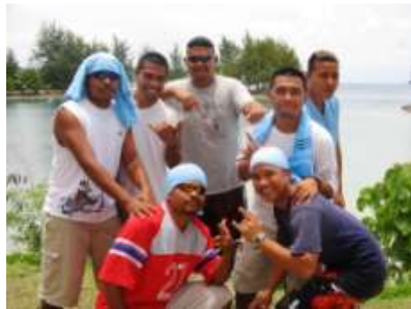
PCC students at JPF Bridge

The following college functions come under the administration of Education and Training Department: Academic Affairs Division, Student Services Division, Continuing Education Division, and Library Resources Division.