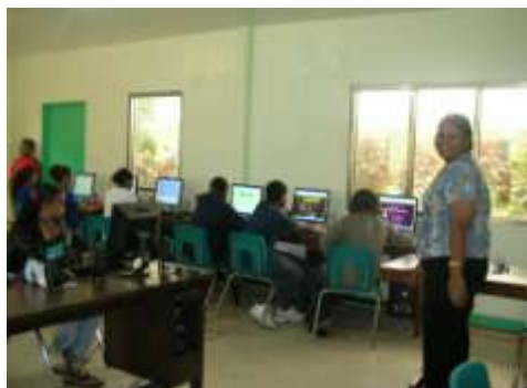
Computer Laboratory Classroom 2008