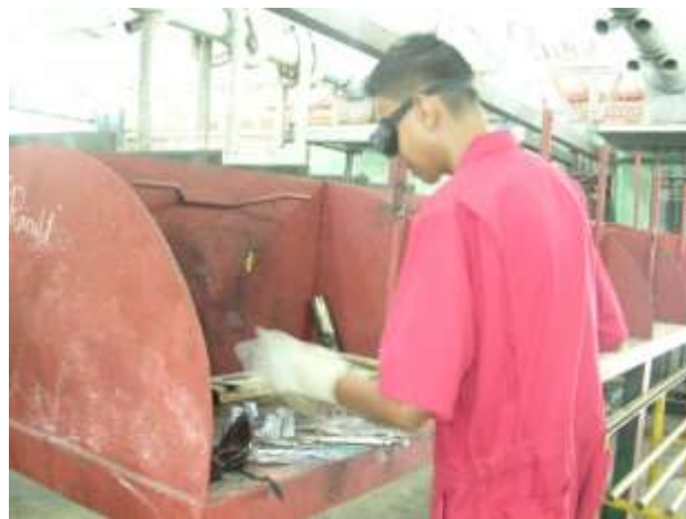
Automotive Body Repair Student, 2008