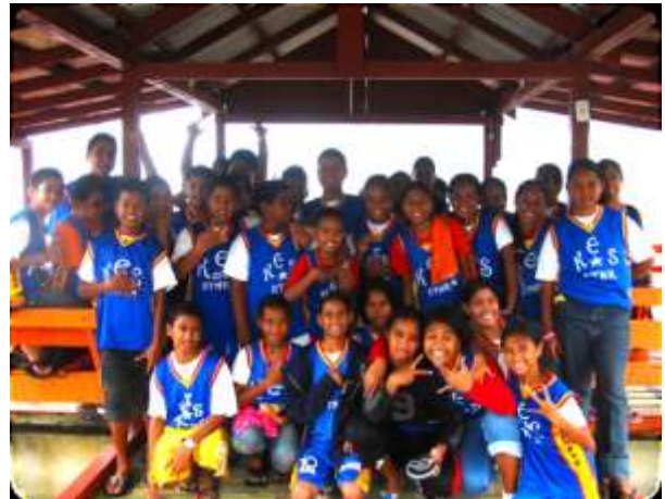
Educational Talent Search Students

The Federal TRIO Programs are educational opportunity outreach programs designed to motivate and support students from socioeconomically disadvantaged backgrounds. TRIO includes six outreach and support programs targeted to serve and assist low-income, first generation college students and students with disabilities to progress through the academic pipeline from middle school to postbaccalaureate programs. TRIO also includes a training program for directors and staff of TRIO projects, and a dissemination partnership program to encourage the replication of adaptation of successful practices of TRIO projects at institutions and agencies that do not have TRIO grants.