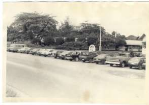
Micronesia Occupational College parking lot, 1980

individual's employment, unreasonably interferes with an individual's work performance, or creates an intimidating, hostile, or offensive work environment.