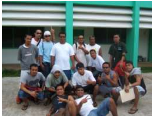
PCC Dorm Residents Men's Retreat 2007