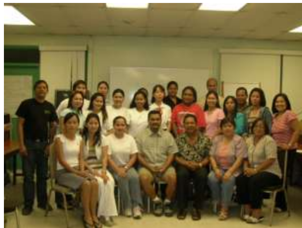
Mandarin workshop for CE Language Classes

This course provides the student practical training in his/her choice of career. With the assistance of an instructor-coordinator, the student is assigned to work under a supervisor in a governmental department or a private business in order to learn through actual work experience. As this is a job-entry level learning experience, emphasis will be on entry-level skills, good work attitudes and habits, and an exploration of the student's area of interests as preparation for further training or for full-time employment. Pre: All courses in Track Ia. (Contact Hours: 90)