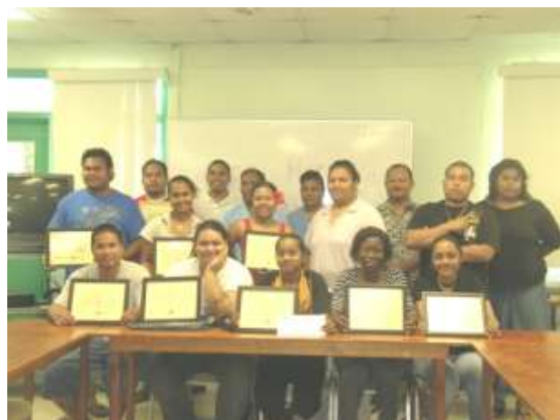
Health workshop for Public Health Care Service

This Career Skills choice requires the student to produce proof of gainful employment that resulted in marketable skills, or proof of marketable skills regardless of employment history, or being enrolled in a training program leading toward a marketable skills. Pre: All courses I Track Ib. (Contact Hours: 90)