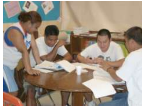
PCC student English Tutoring Session