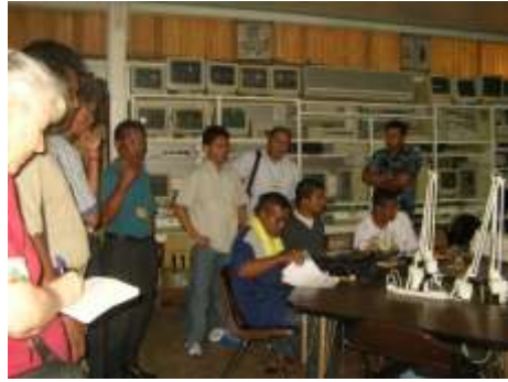
Electronics Technology Student demonstration