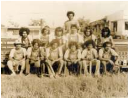
MOC Baseball Team 1974