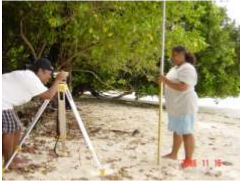
Marine/Environmental Science Student