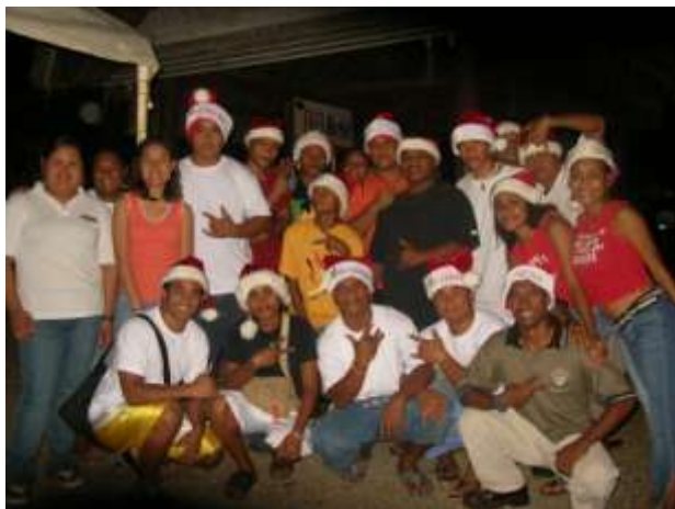
PCC Students joining in the Children's Christmas Caroling Program, 2006