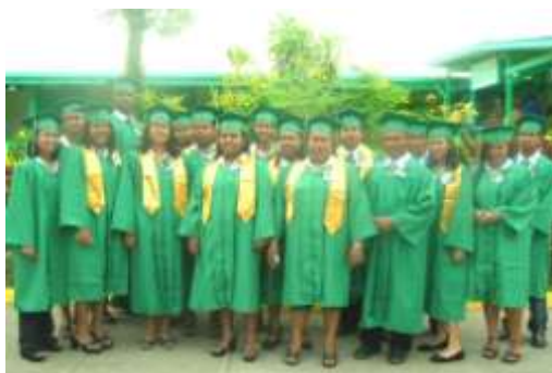
PCC Graduation Day 2007