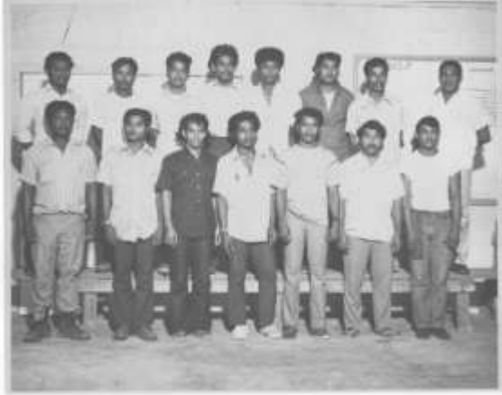
MOC Students 1974