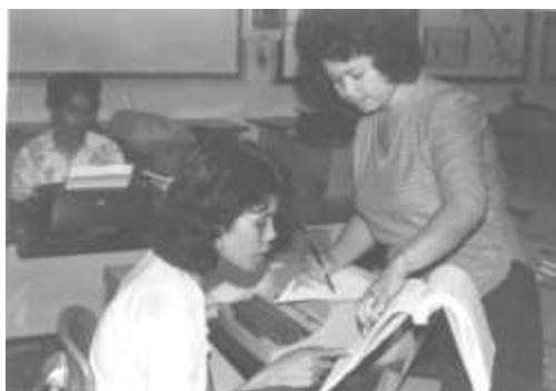
MOC Typing Class 1984