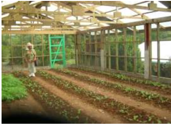
Greenhouse at Ngermeskang