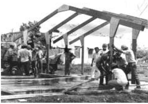
Construction Students building the LCO Building