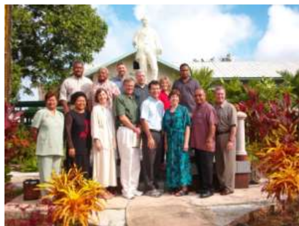
PCC Board of Trustees members and the Accreditation Team, 2003