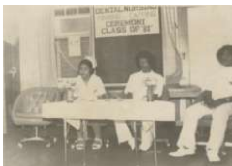
MOC Dental Nursing Class 1981