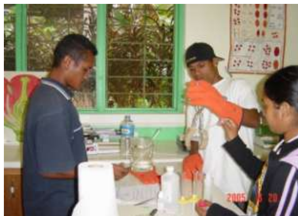
PCC Science Students