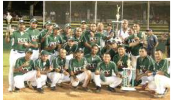
PCC Baseball Team 2008