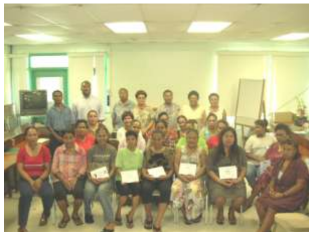
PCAA Teachers and staff workshop

This course specifically prepares students to take and pass college entrance examinations; teaches students good study skills and habits, time management, and college life skills needed to succeed in college. The Students will be assisted with all the required college admissions forms and financial aid application forms. The Students will also prepare for and take the Ability To Benefit (ATB) test. Pre: All other courses I the Track II program. (Contact Hours: 90)