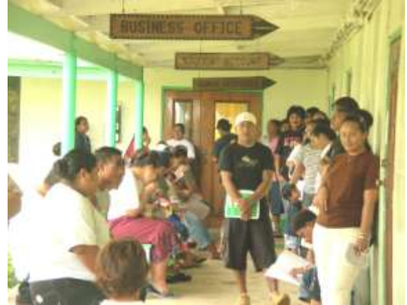
Fall Registration 2007