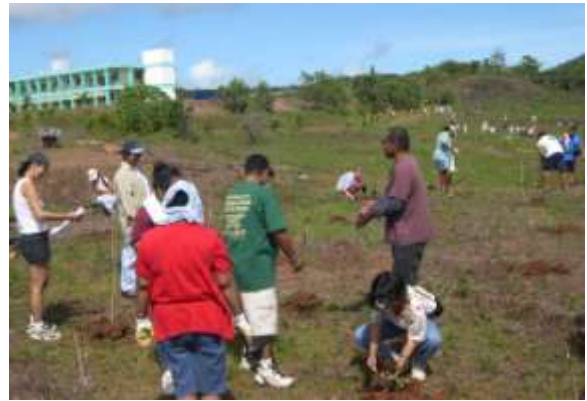
Faculty & Staff planting trees at Ngermeskang

The Cooperative Research & Extension (CRE) Department implements the Agriculture Experiment Station (AES), Cooperative Extension Service (CES), and Residential Instruction (RI) of the College of Micronesia Land Grant Programs in Palau. CRE's programs are done in a multi-disciplinary approach through the three main divisions: Agriculture, Natural Resources and Environmental Education, and Family and Consumer Education.