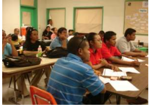
SSS – Project Beacon study skills workshop