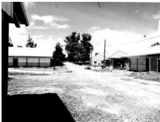
MOC Shops Buildings 1975