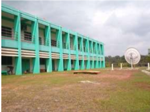
CRE Station at Ngermeskang, Ngaremlengui