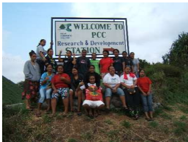
PCC Dorm Residents Women's Retreat 2006

This course is designed to give the students a general background in metals. It covers different types of metals and their alloys including processing, properties and their uses. Pre: None (3 credits lec)