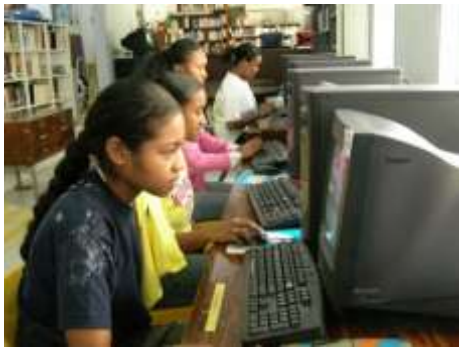
Computers at the Library Research Area