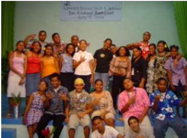
Upward Bound Math & Science students