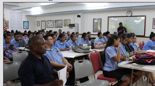
First year and Continuing students of Upward Bound

Palau Community College - Upward Bound Program held their Student Orientation on October 23, 2017 for the 2017-2018 Academic Year. Students from the local high schools attended the session to learn more about the Upward Bound classes, workshops, and related program information.