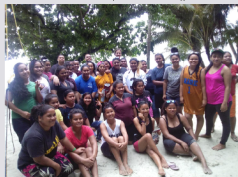
PCC female students pose at Ngeremdiu Rock Island