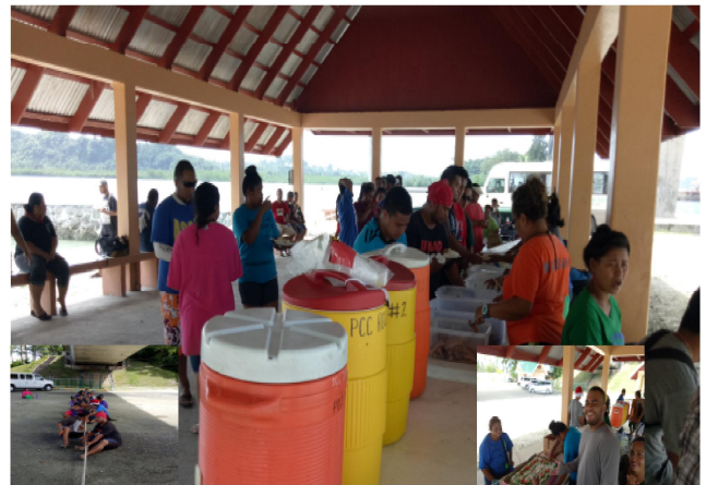
Students enjoying lunch served by PCC dorm managers, Inset: Tug of War and student serving cake

On December 13, 2017 Palau Community College Dormitory students had their “End of the Year Activity at Japan-Palau Friendship Bridge at Aiarai State. Over 80 students participated in this end of the semester gathering before Christmas holiday. Students also had lunch and participated in a fun and games activity planned for them by the Student Life and Housing Office. Students were divided into 5 teams in competing for prizes. Teams had to compete in tug of war, three point shooter, and three in one relay to earn most points to win a prize. 1st prize went to Team Blue, 2nd prize - Team Red, 3rd prize - Team Green, 4th prize - Team Purple, and 5th prize went to Team Pink. The day was filled with laughter and dancing as students celebrated the end of Fall Semester 2017.