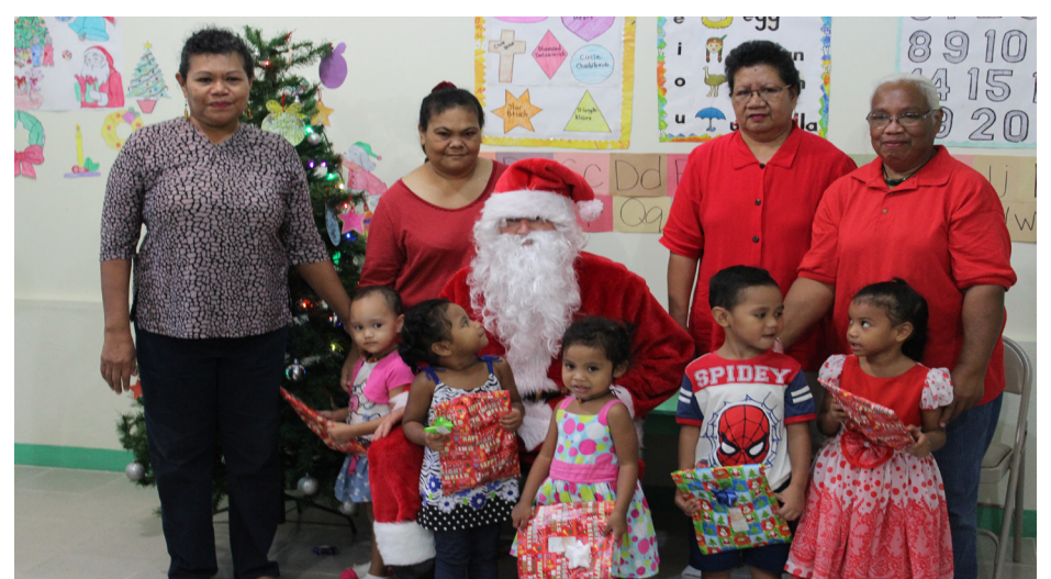
PCC Day Care Teachers, PCC Library staff, CAT Santa Claus, and children during christmas program

On Wednesday, December 20, 2017 PCC Day Care Center held its Christmas Program. The children performed christmas songs including Palau National Anthem, gospel hymns, and alphabety song. Civic Action Team officer volunteered as Santa Claus to cheer up the children christmas spirit while distributing christmas gifts and candies. PCC Day Care Center would like to thank all the parents as well as PCC students who attended the program. Your presence added much joy to the holiday festivity and inspired a feeling of merriment amongst the children.