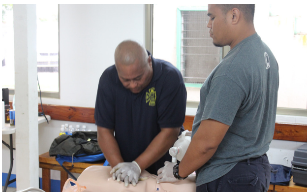
Administration of cardiopulmonary resuscitation (CPR)