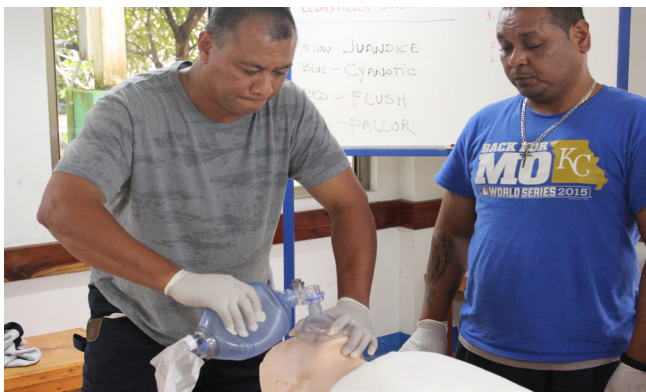
Officers established and maintained airway

EMT refresher courses are non-credit short-term certificate programs designed to fast-track students into the job-market and meet workforce industry needs whereby specific degrees such as an associate's or bachelor's degrees are not required. The contact hours earned in these programs are not transferable into a different degree pathway, but are only specific for certification or licensure eligibility in these specific fields. Class meeting times are usually non-traditional and often held during the evenings or weekends to meet the needs of those who work as in the case of Fire and Rescue Officers from the Bureau of Public Safety.