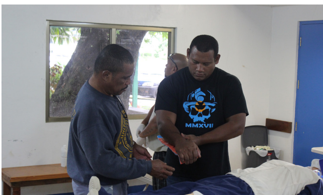
Immobilizing of fractures and bandaging of wounds

EMT program include classroom instruction, problem-based learning, clinical experience within hospitals, and practical learning experience in ambulances. Students may gain the competencies required for entry-level positions in the field.