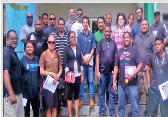
Energy Audit Training participants during training at Palau Community College

Palau Community College (PCC) hosted the First Energy Audity Training at PCC Continuing Education Training Room. The 5-day training provide for participants basic energy inspection, survey, and analysis of energy flow, energy conservation in building, and system to reduce energy input without disruption of energy flow. Topics also discussed during the training were Energy Management, Audit Levels and Procedures, Financial Metrics, Safety, Building Envelope, Low and High Bay Lighting, Exterior Lighting, Water Efficiency, Cooling Systems, Renewable Energy, Photovoltaics, Solar Water Heating, Wind Power, Hands-On Building Energy Audit (HOMER), Energy Modeling: Energy Savings and Economics Analysis.