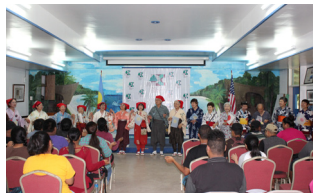
Hagoromo Ichiza Volunteer Group perform traditional songs