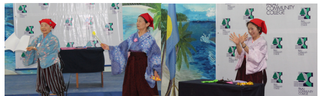
Hagoromo perform magic tricks