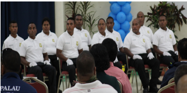
24 th Police Academy Cadets