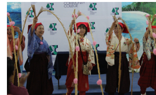
Hagoromo perform dance with bamboo sticks