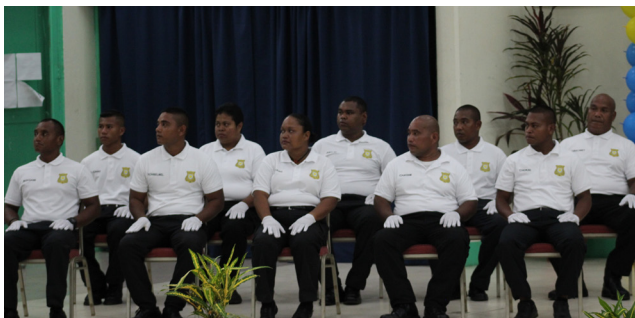
24 th Police Academy Cadets