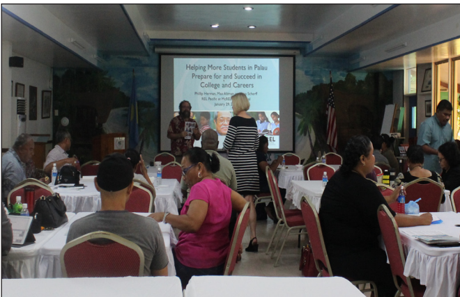
PCC and MOE staff participating in round table discussion

On January 29-30, 2018, Regional Educational Laboratory (REL) Pacific 2nd Collaboration Meeting took place at Palau Community College (PCC) Assembly Hall. This is a follow-up meeting on College and Career Readiness and Success (CCRS). Participants from Ministry of Education and Palau Community College were updated with information to support College and Career Readiness and Success. In order to assist high school students to graduate and enroll in college-level courses, Quantway was introduced as an avenue for participants to utilize as a base model to assist underserved students to complete and excel in their developmental mathematics requirements. Another model course introduced was Statway. Statway is a year-long introductory college-level statistics course that provides students and college institutions with a more successful alternative to traditional developmental mathematics. This collaborative meeting provided by REL Pacific to engage in student success after high school is both PCC's and MOE's mission and prerogative.