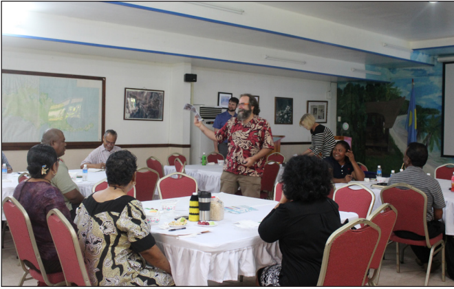
PCC and MOE staff participating REL Pacific 2 nd Collaboration Meeting

On January 29-30, 2018, Regional Educational Laboratory (REL) Pacific 2nd Collaboration Meeting took place at Palau Community College (PCC) Assembly Hall. This is a follow-up meeting on College and Career Readiness and Success (CCRS). Participants from Ministry of Education and Palau Community College were updated with information to support College and Career Readiness and Success. In order to assist high school students to graduate and enroll in college-level courses, Quantway was introduced as an avenue for participants to utilize as a base model to assist underserved students to complete and excel in their developmental mathematics requirements. Another model course introduced was Statway. Statway is a year-long introductory college-level statistics course that provides students and college institutions with a more successful alternative to traditional developmental mathematics. This collaborative meeting provided by REL Pacific to engage in student success after high school is both PCC's and MOE's mission and prerogative.