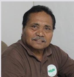
GOV. FLORENCIO ADELBAI