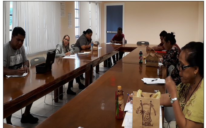
PCC Technology Resource Committee meeting at Tan Siu Lin PCC Library

Palau Community College Technology Resource Committee (TRC) held a meeting on February 1, 2018, to discuss proposed registration software for the Registrar Office. Also discussed in the meeting was the PCC Library Union Catalog membership fee and Technology Use Policy. The Committee also discussed plans for improved internet access for dorms, shops, and CRE.