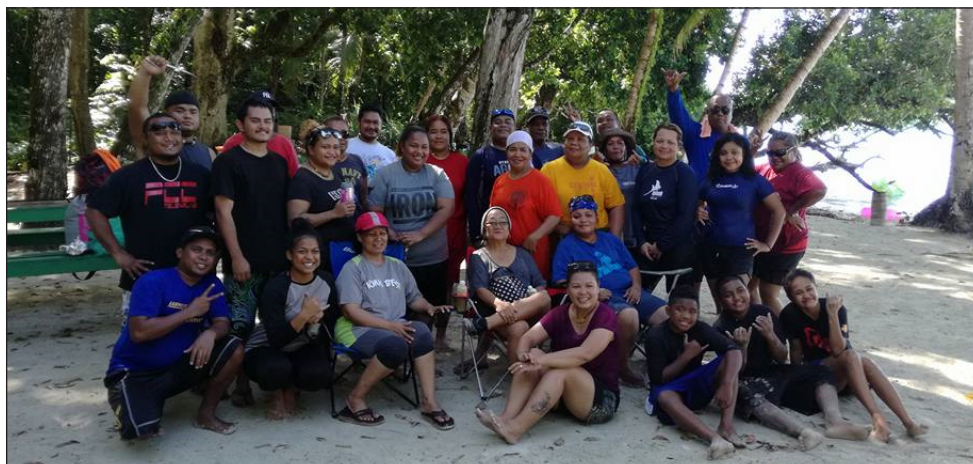
CSO Officers and members during their End of the Year celebration at Ngeremdiu Rock Island