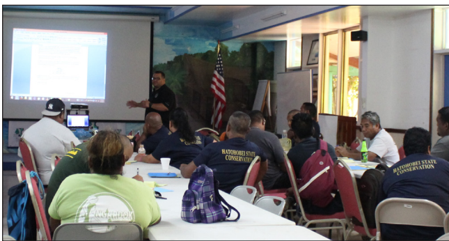
Enforcement Officers at the PCC Assembly for the Protected Areas Enforcement Training

On February 12-16, 2018 a Guam Representative and the Palau Department of Agriculture Enforcement Section conducted a training workshop at PCC Assembly Hall for Protected Areas Network Enforcement officers. The training was held from 8 am to 4:30 pm from Monday to Friday. Six states participated in this training: Airai, Aimeliik, Melekeok, Ngchesar, Ngardmau, and Hatochobei.