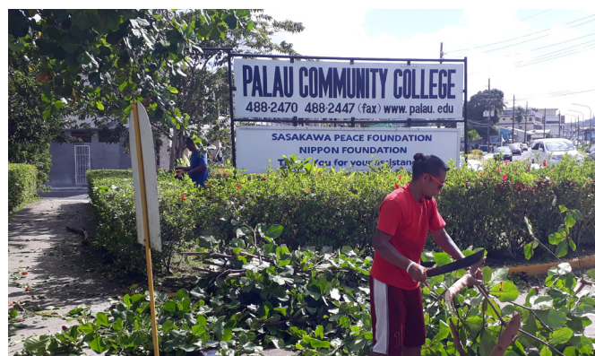
PCC thanks maintenance for cleaning up the campus