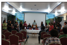
(top photo): New members of the Phi Theta Kappa International Honor Society - Beta Omicron Zeta Chapter at the Induction Ceremony (bottom photos)

An Induction Ceremony for the new members of the Phi Theta Kappa International Honor Society (PTK) - Beta Omicron Zeta Chapter was held at the Palau Community College (PCC) Assembly Hall on Friday, February 16, 2018. Four (4) new officers were sworn-in along with the fourteen (14) members who were inducted into the honors society.