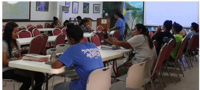
PCC students participating in a MLA Workshop conducted by PCC Learning Resource Center at PCC Assembly Hall

On February 22, 2018, Palau Community College (PCC) Learning Resource Center (LRC) held an Modern Language Association (MLA) Workshop at the PCC Assembly Hall from 12 pm to 1 pm. The purpose of the workshop was to reiterate the importance of documenting sources in papers written using outside sources and avoiding plagiarism. The workshop information are the works of Modern Language Association with the mission to promote study and learning of languages and literatures through various programs, publications, and conventions. MLA published style guides for the association members to share their scholarly work and teaching experiences. LRC continues to offer the same workshop. Students who are interested should contact LRC at 488-3073.