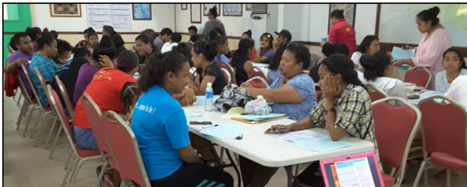
Palau Community College students during Financial Aid sessions at PCC Assembly Hall

Financial Aid Night Sessions Continued from page 1