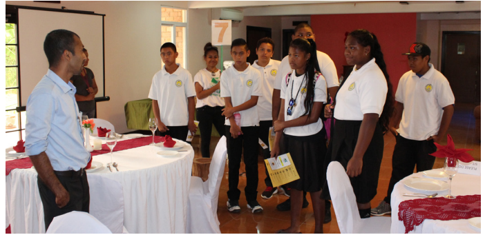
Melekeok Elementary Students visiting Tourism & Hospitality Program

Airai Elementary School, Ibobang Elementary School, Ngaraard Elementary School, Ngerchelongs Elementary School, Seventh Day Adventist Elementary School, George B. Harris Elementary School, Meyuns Elementary, Aimeliik Elementary School, Ngardmau Elementary School, Koror Elementary School, and Ngeremlengui Elementary School. For more information about the event, please call the PCC Academic Affairs Office at 488-2470/2471 ext. 245, 246, or 247.