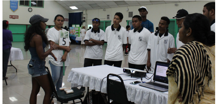
STEM Program student giving presentation to the Emmaus-Bethania High School Seniors