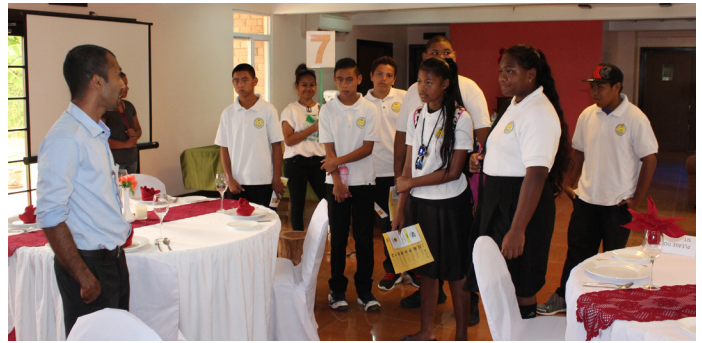
Melekeok Elementary Students visiting Tourism & Hospitality Program