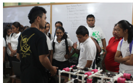
Moments of the 2018 Career and Technical Education Awareness Week

Palau Community College (PCC) hosted the Annual Career & Technical Education (CTE) Awareness Week from March 13 to March 14, 2018. The awareness week is an opportunity for the college to showcase and promote its programs to elementary and high school students as well as community members. Students from the elementary schools and high schools of Palau participating in the program visited all the technical education programs offered at the college. In addition, students also learned about other academic programs that are offered. College faculty members and program students demonstrate and display projects as part of student learning outcome. This year, over three-hundred (300) students from the local elementary and high schools participated in the CTE Awareness Week hosted by the college. Participating schools were Palau High School, Emmaus-Bethania High School, Belau Modengkei School, Mindszenty High School, Maris Stella Elementary School, Melekeok Elementary School,