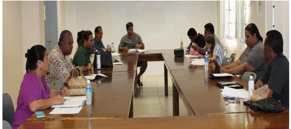
TRC members reviewing Cyber Security Policy Manual