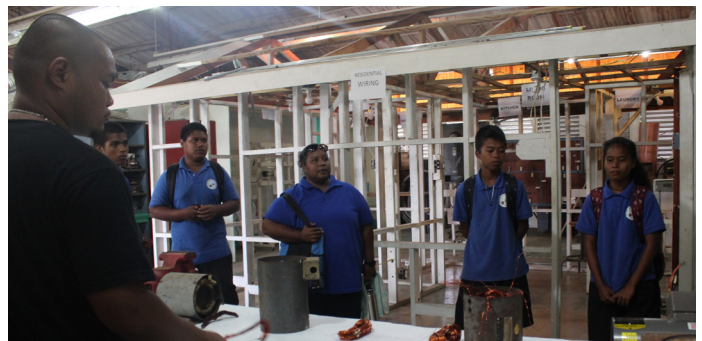
Electronics Technical Program showcase electronic motors to Aimeliik Elementary School 8th graders