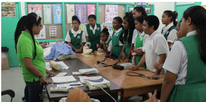
Maris Stella 8th graders at Nursing Program