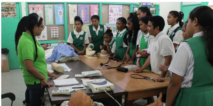
Maris Stella 8th graders at Nursing Program