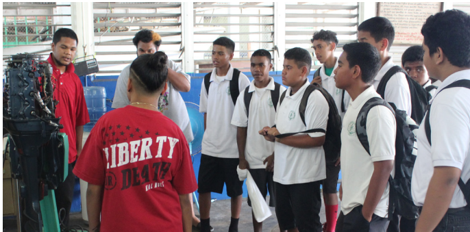
Small Engine Program student demonstrates using 2 cycle boat engine to Maris Stella 8th Grade students