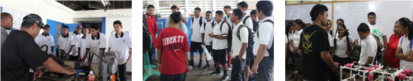
Moments of the 2018 Career and Technical Education Awareness Week

Palau Community College (PCC) hosted the Annual Career & Technical Education (CTE) Awareness Week from March 13 to March 14, 2018. The awareness week is an opportunity for the college to showcase and promote its programs to elementary and high school students as well as community members. Students from the elementary schools and high schools of Palau participating in the program visited all the technical education programs offered at the college. In addition, students also learned about other academic programs that are offered. College faculty members and program students demonstrate and display projects as part of student learning outcome. This year, over three-hundred (300) students from the local elementary and high schools participated in the CTE Awareness Week hosted by the college. Participating schools were Palau High School, Emmaus-Bethania High School, Belau Modengkei School, Mindszenty High School, Maris Stella Elementary School, Melekeok Elementary School,