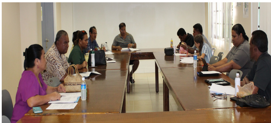
TRC members reviewing Cyber Security Policy Manual