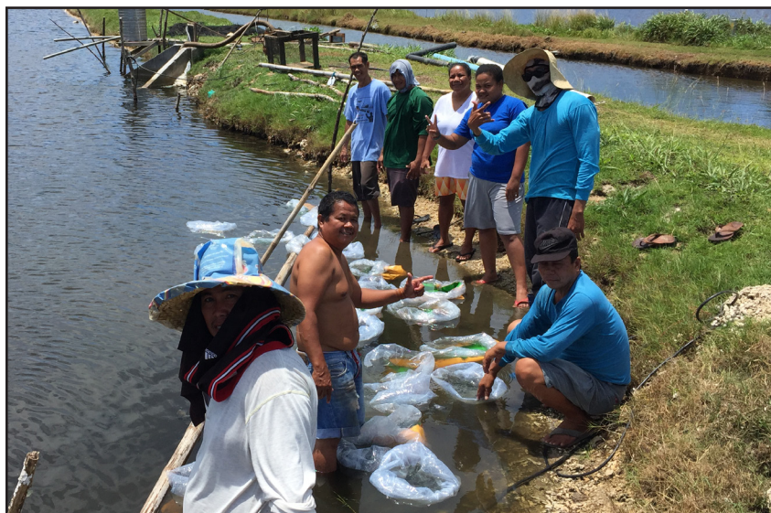
Milkfish fry being acclimatized before releasing into the nursery ponds in Ngatpang

In support of Palau's aquacultural development in the area of commercial farming, the Cooperative Research & Extension of Palau Community College (PCC-CRE) recently implemented a project that supports the local production of milkfish ( Chanos chanos ). Milkfish (known as "aol" in Palau) seeds are imported from outside sources. By establishing a local source for milkfish seeds, PCC-CRE can guarantee that local commercial fish farms continue in support of Palau's economy.