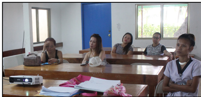
Participants of the Food Handling Workshop

Public Health Office of the Ministry of Health along with Palau Community Action Agency started their workshop on January 16, 2018 to April 26, 2018 about Food Handling at PCC Continuing Education. Held at PCC Continuing Education, the workshop is to trained interested individuals on proper food handling. Republic of Palau laws mandate all individual involved in handling of food intended for sale or the sale of food to have food handling permits. The permits are valid for two years and may be renewed. The workshop topics cover biohazards, foodborne diseases, signs of food spoilage, types of food prep contamination, and proper temperature control methods for safe storage of foods, including meat, poultry, and vegetables. Workshop instructors also demonstrate effective food handling techniques that promote cleanliness and safety in food establishments. Interested individual or businesses may contact Dorcas Ngiruchelbad at 488-4772/3.