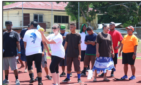
Softball Distance Throw

PCC would like to thank everyone who participated in making its 25th Charter Day Celebration unforgettable. Thank you all for contributing to an amazing day!