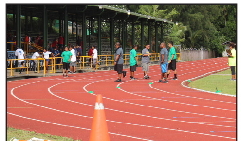
Mix Relay Race