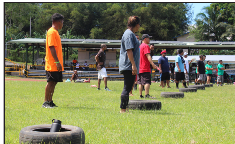
Frisbee Golf Throw