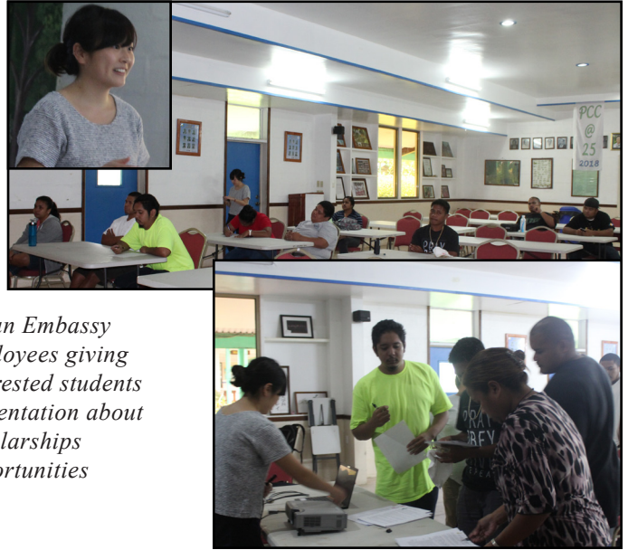
Japan Embassy employees giving interested students presentation about scholarships opportunities