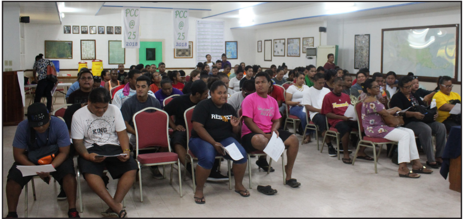
Graduation Sub-Committee on Practice & Usher held a first meeting with graduating class of 2018 at the PCC Assembly Hall.