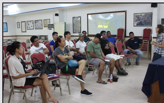
PCC Technical Education Meeting at PCC Assembly Hall