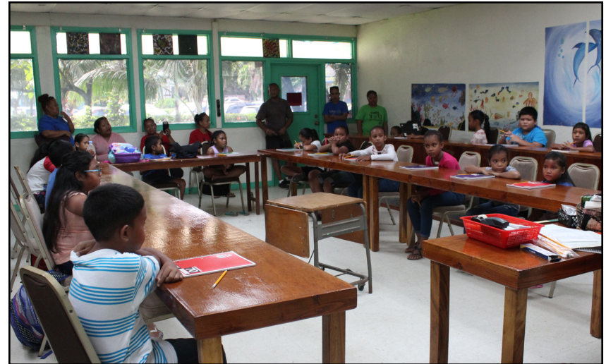
Students in the Continuing Education Summer Kids Program Orientation

On June 11, 2018 Palau Community College Continuing Education Summer Kids Program began and the elementary school students will be spending six (6) weeks participating in various cultural and educational activities at the college.