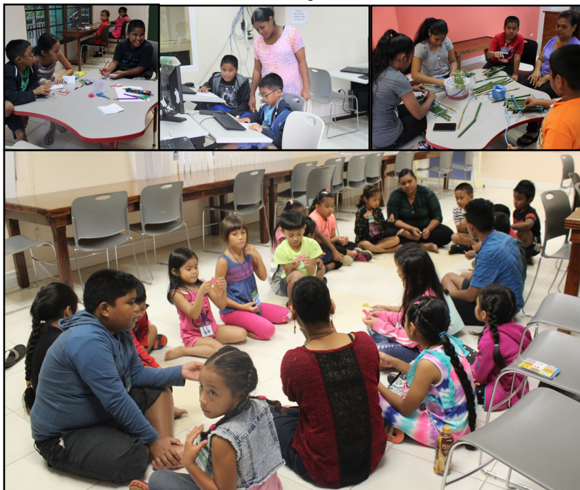
Summer Youth Program participants engaged in various activities with library staff

On Tuesday, July 10, 2018 the Tan Siu Lin Palau Community College (PCC) Library began its Summer Youth Program for ages seventh (7) to twelve (12). Over 40 students participated in this one-week program. The library summer activities were established in order to promote interest in reading & writing, art, and mathematics among the younger population of Palau. The library's staff members engaged in this summer activity with the students in order to form a strong comprehension of arts & crafts, numbers and alphabets. Activities included phonics, paper craft, illustrations and bookmaking, miniature raft, grass skirt, marmar, and online trivia & scavenger hunt that will help the children to recognize and reinforce letters, numbers, art, and songs and movies. Activities also gives the opportunity for the library to promote its Kids' Korrner Collection, Coral Cafe, and Teen Space by encouraging the students to visit the library for more reading & writing activities.